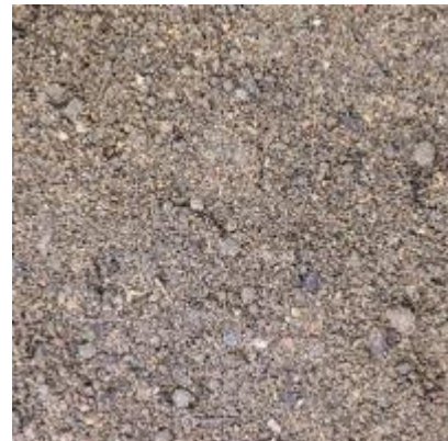
HERMANN'S SOIL AND MULCH