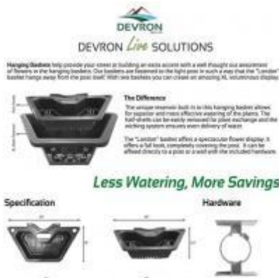
DEVRON SALES LTD.