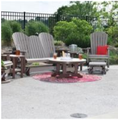
BOSMAN HOME FRONT INC