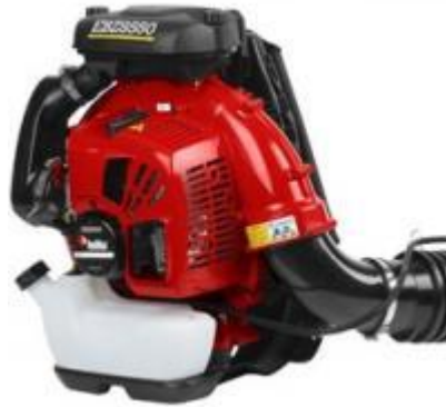
PRICELESS PRODUCTS LANDSCAPE DEPOT