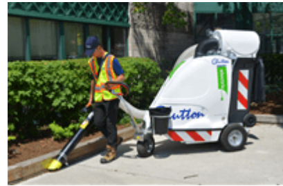
JOE JOHNSON EQUIPMENT INC