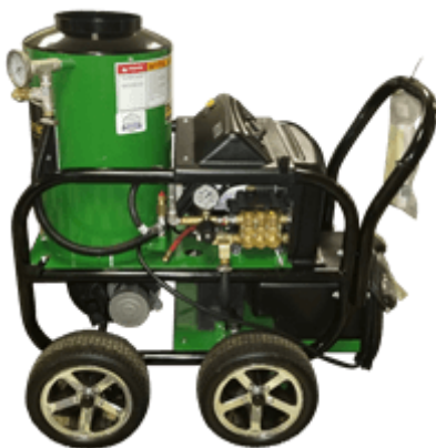
STEAM 'N' WEEDS