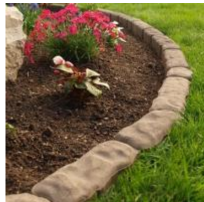
BROOKLIN CONCRETE PRODUCTS