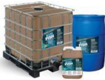
EARTH ALIVE CLEAN TECHNOLOGIES / ROOT RESCUE ENVIRONMENTAL PRODUCTS