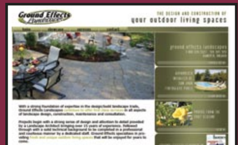
Future Lawn Inc., Web Sites