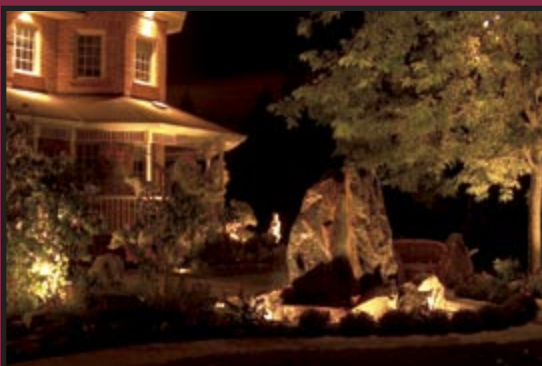
DiMarco Landscape Lighting, Landscape Lighting Design & Installation