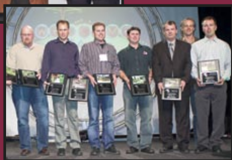
A group of winners from the private residential maintenance, 15,000 sq ft - 1 acre category