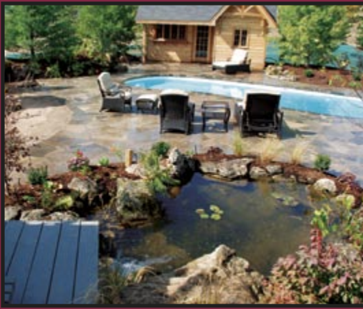
Timber & Associates Residential Construction, $250,000-$500,000