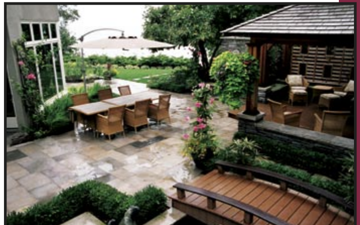
International Landscaping Inc., Dunington-Grubb Award for Best Overall Construction Project