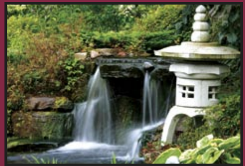
Garden Creations of Ottawa Ltd. Construction, Water Features