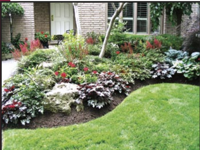
Evergreen Landscaping & Lawn Maintenance, Grounds Management Award for Best Overall Maintenance Project