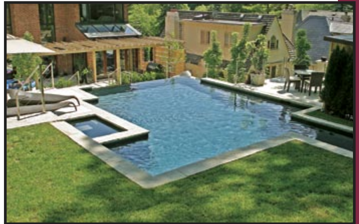
Markville Landscaping & Nurseries Inc., Casey van Maris Award for unique and innovative design in landscaping

From landscape construction and maintenance to design and interiorscaping, Landscape Ontario members shine in the quest for horticultural excellence. Each year, at Landscape Ontario's Awards of Excellence ceremony, landscape professionals join together to recognize top-notch talent. Hundreds of LO members turned out for the Awards ceremony and celebration of excellence on January 8, at Congress 2008.