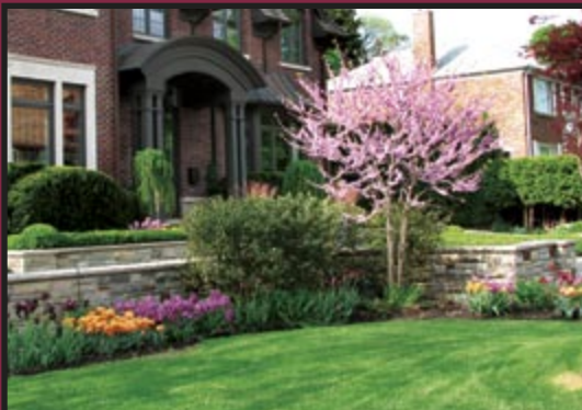
Lawrence Park Garden Care Ltd. Private Residential Maintenance, 15,000 sq ft-1 acre