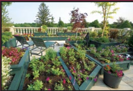
Perennial Gardens Construction - Theme Gardens