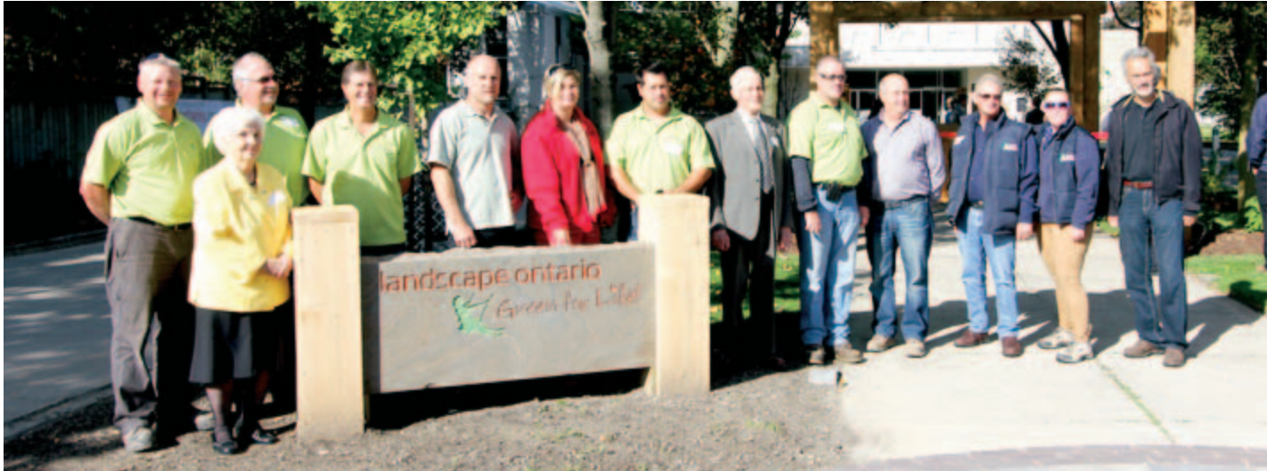
Waterloo Chapter took care of greening another school this year, when Elmira District High School was chosen as the winner.