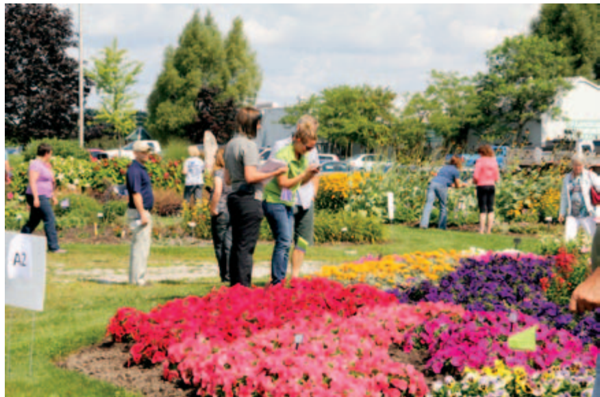
Each year the trial gardens open house provides industry members the opportunity to see how new plant introductions perform under realistic conditions.

A two-day open house was held on Aug. 16 and 17, with industry members attending on the Friday. Over 100 attendees observed