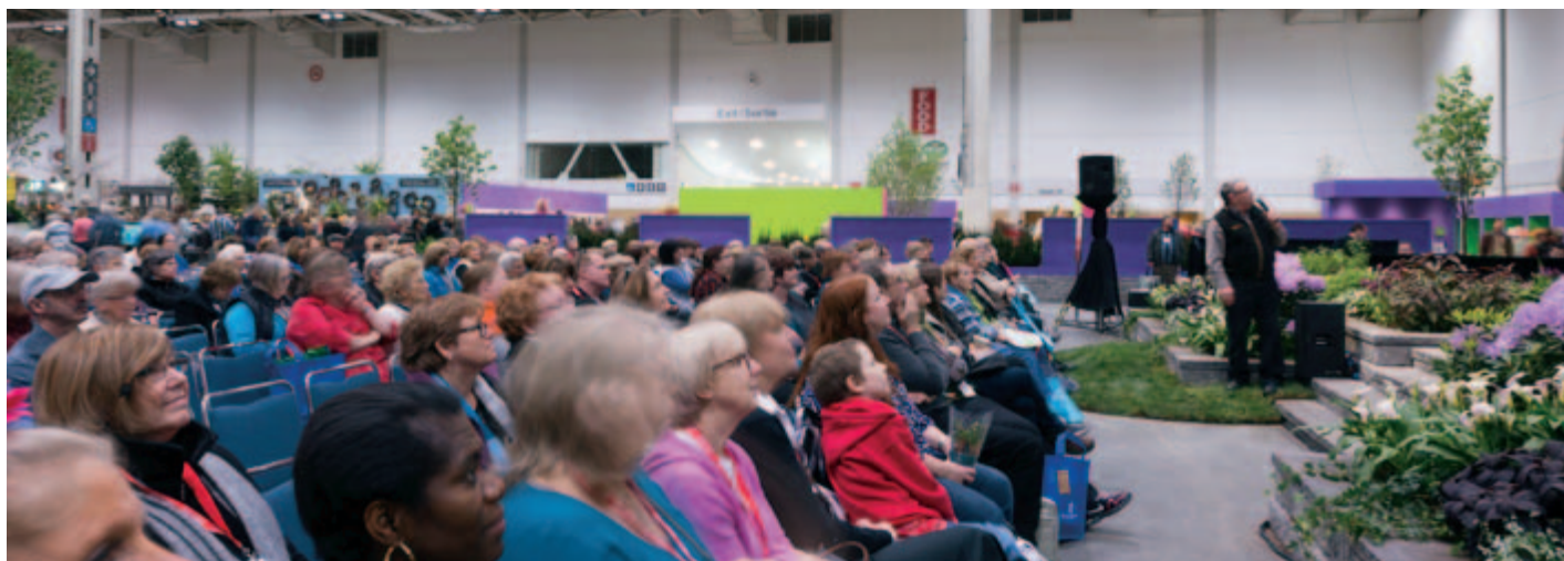
Canada Blooms provides a significant opportunity for Landscape Ontario to promote the industry to the public.

Director of Public Relations and Membership Services 2012 - 2013