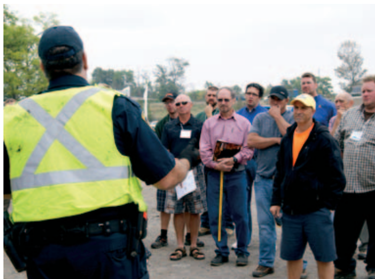
Snowposium 2013 offered a huge amount of information to attendees. One of the most popular events was the MTO presentation.