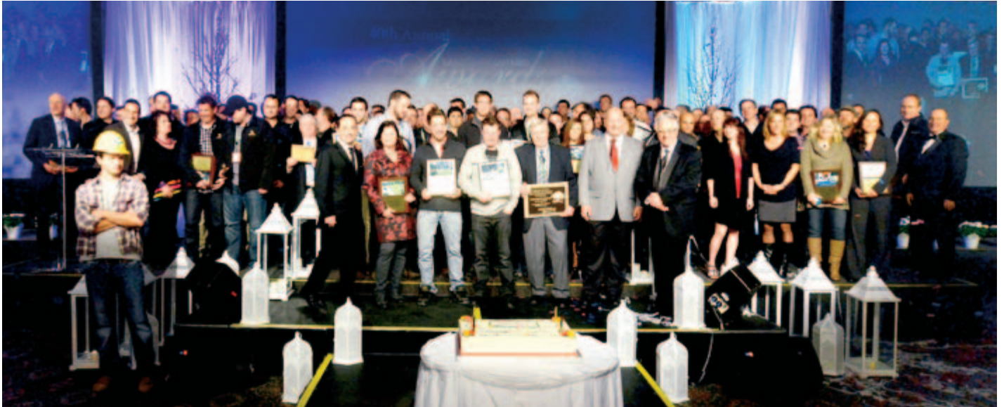
The Awards of Excellence are one of the highlights on Landscape Ontario's yearly calendar

floor space. An additional saving of $50,000 on expenses resulted in a very positive bottom line. Attendance remained consistent at close to 13,000 delegates.