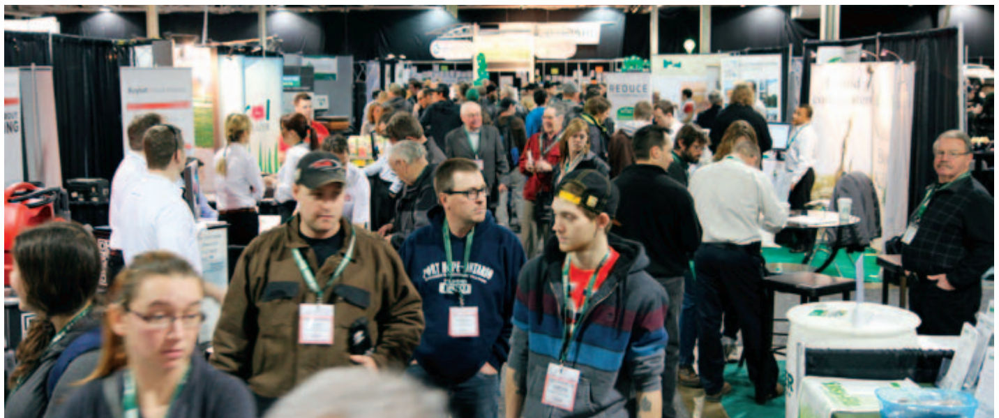
Congress is ready to mark its 41st year.

Among the main highlights was the upswing in exhibit sales. Revenue trended nearly $40,000 above the event's budgeted $1.9 million, despite a last-minute exhibit hall renovation that reduced salable