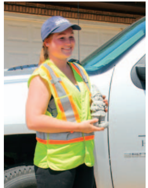
Visits by the membership department to members at their jobsites resulted in many positive comments. Green Ventures Landscape Care crew members from the Waterloo Chapter take a break on the job, while Grout, the LO Gnome, makes a new friend with Grieve Home Maintenance of the Golden Horseshoe Chapter.