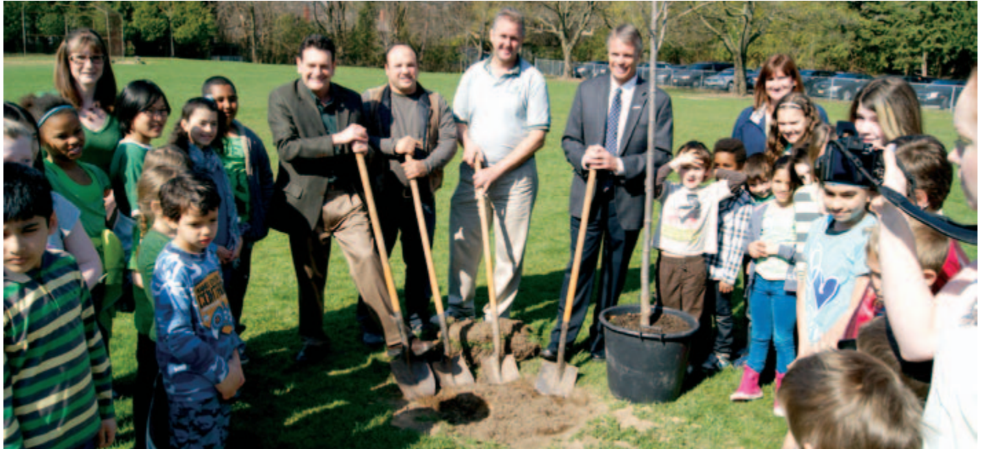
Golden Horseshoe Chapter helped a Burlington school improve conditions, when it planted ten trees during Arbor Day.

Rogers Centre in November, 2012, for a great match-up between the Argos and the Ti-Cats. Fun was had by all in this nail biting game that tied until the last minute when the Argos won with a final score of 43-40. Special thanks to sponsors Permacon, Techniseal, and Techo-Bloc.