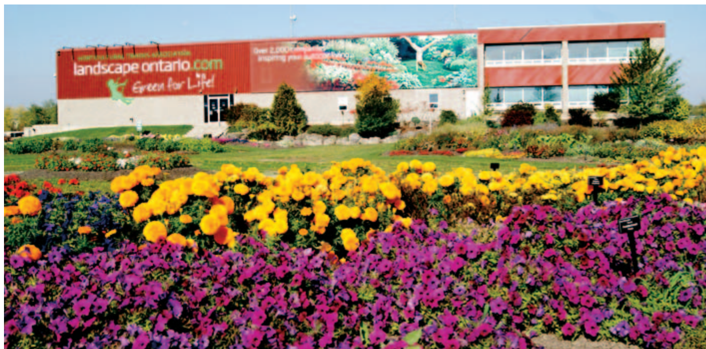
In coming years, members can look forward to improved functionality and image from the LO home office.

As a member of Landscape Ontario, you are automatically a mem-