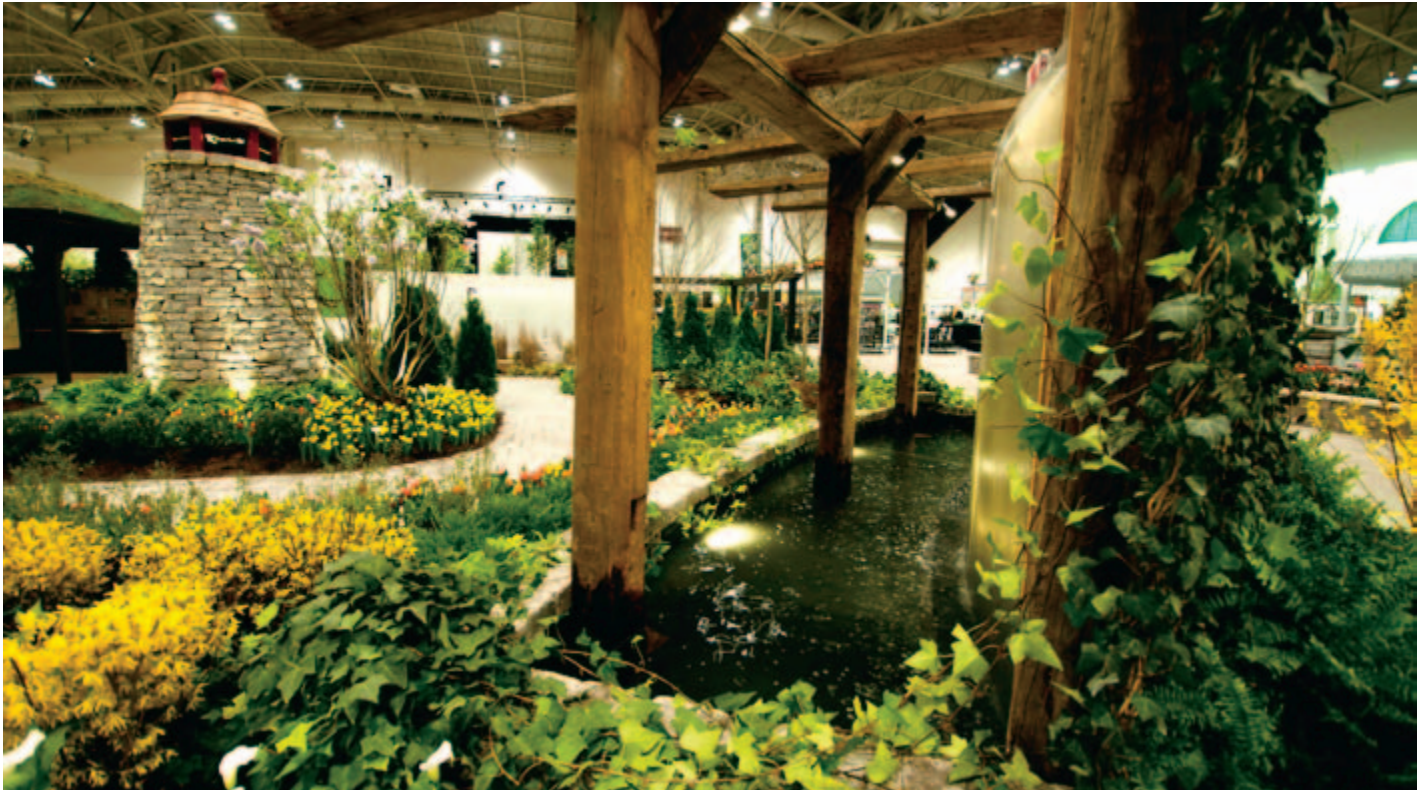
Landscape Ontario's garden drew rave reviews from those attending Canada Blooms in March.