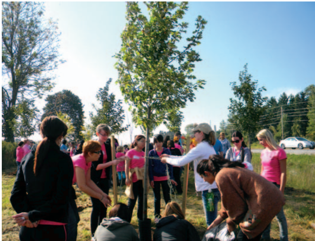
The London Chapter has gained huge coverage on its Veterans Memorial Parkway project.

“With an investment of $144,000 of industry cash and $151,000 of in-kind from LO and LO members, another $1.15 million was contributed by these matching programs to support research efforts that totalled $1.45 million. The return on investment is clearly in the favour of all LO members when we can partner with the generosity of the provincial and federal governments. The return becomes even greater for LO when you start to consider the answers these projects have provided to members as they approach the day-to-day problems in their businesses. On top of that, working with VRIC on many of these projects has allowed for the building of a strong research team that can respond to, and find solutions for, the horticulture sector.