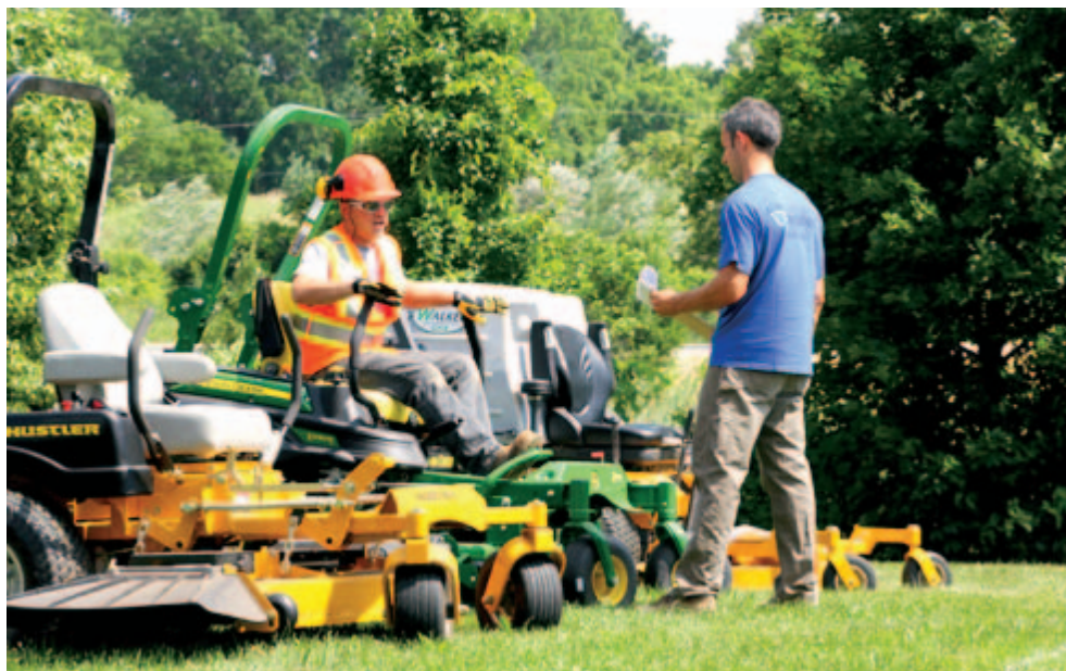
Four Landscape Industry Certified practical tests were held during the year.

Recommendations from this committee have benefitted members greatly in 2012 and 2013. We thank the committee for the continued leadership and contributions to ever-improving professional development opportunities for the industry.