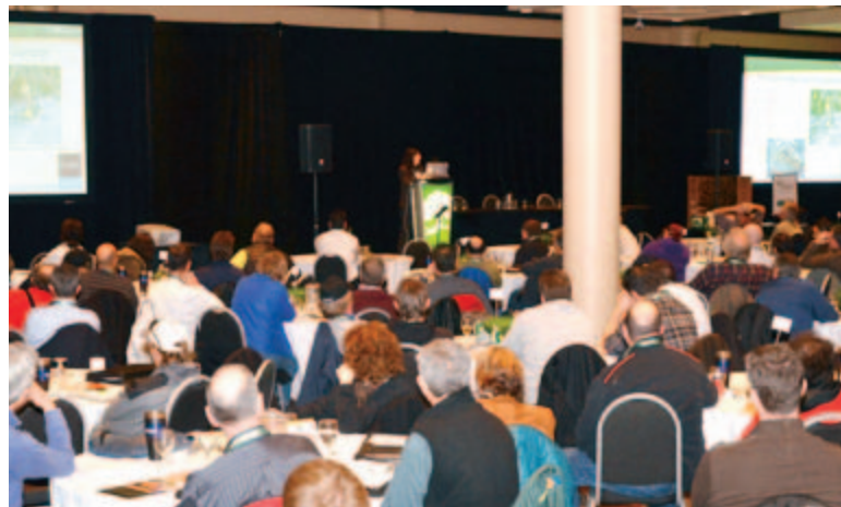
It was a capacity audience at last year's IPM Symposium at Toronto Congress Centre.

A special note of appreciation to all our sponsors; we could not