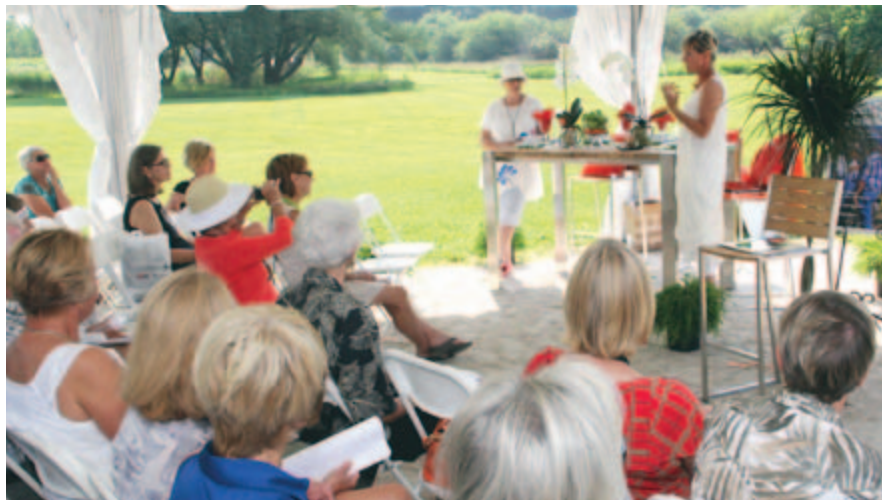
The first-ever Back Yard Glam Tour included gardens created by Landscape Ontario members in Hanover (Southern Grey County) and the Georgian Bay area (Thornbury).

With close to 30 companies attending, the Chapter found great support for this initiative. This event was followed by two job fairs. Both employers and job seekers benefited from attending the horticulture industry job fairs. Barrie hosted the first Simcoe Muskoka Horticultural Apprenticeship Job Fair, with the second event held in Collingwood. The fairs gave high school and post-secondary students the chance to meet with prospective employers, and explore the great learning and career opportunities offered through apprenticeship. Employers sought to recruit new talent, and learned how apprenticeship can