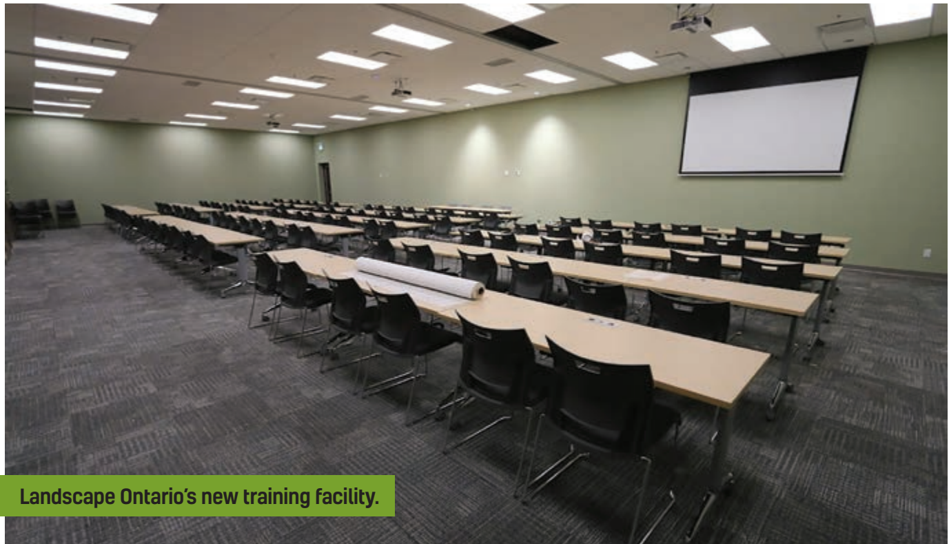
Landscape Ontario's new training facility.