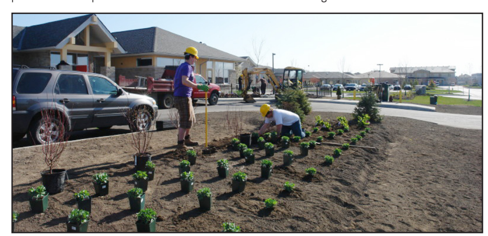
Gilda's House was a major project in Georgian Lakelands

We took time to hit the golf course in August. Innisbrook Golf and Country Club hosted our annual tournament and did a wonderful job accommodating our needs and golfers.