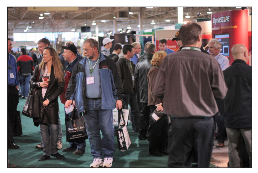
Congress numbers up in 2010

product knowledge (67.6 per cent), discovering industry trends (55.4 per cent) and purchasing (40.5 per cent) for the spring season.