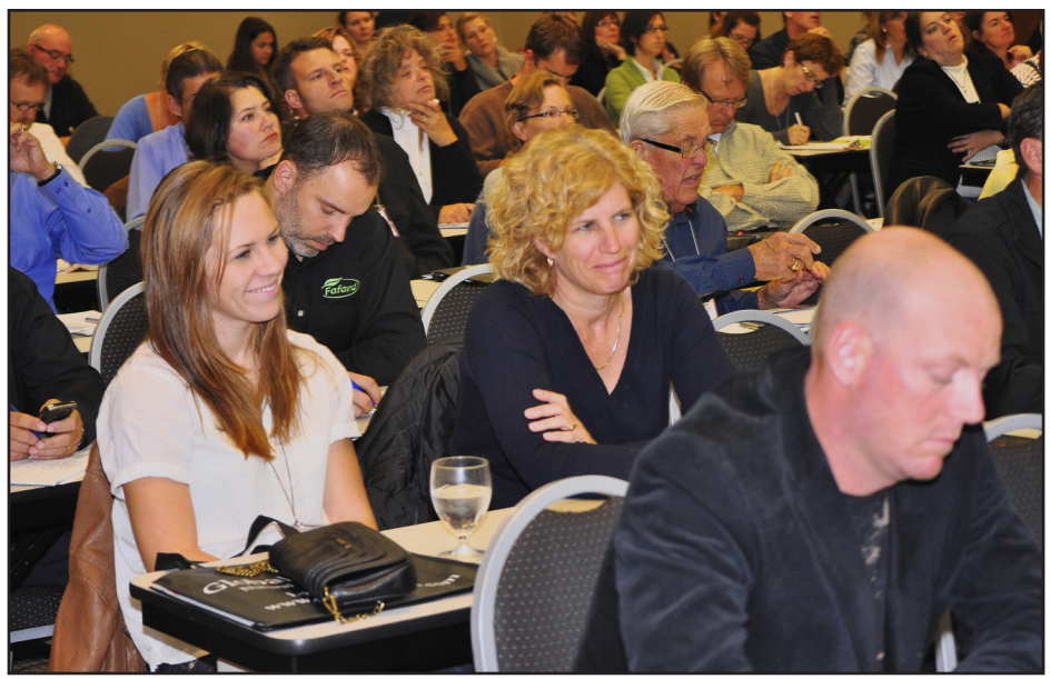
Education remains a priority for LO.