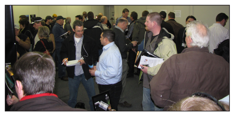
Lighting symposium was sold out.