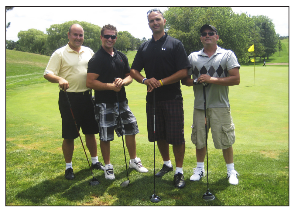
Golf tournaments continue as major events for chapters.

In August, the annual golf tournament was held