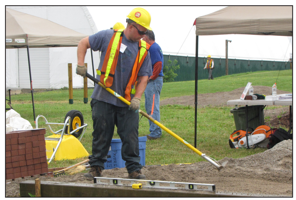
Certification underwent changes.

human resource development strategies included the delivery of comprehensive offerings, including seminars, conferences, symposia, chapter education, endorsed supplier network, Landscape Ontario resource booth at trade shows, web education, certification, apprenticeship support, post-secondary curriculum support, skills development, Safety Groups and resources.