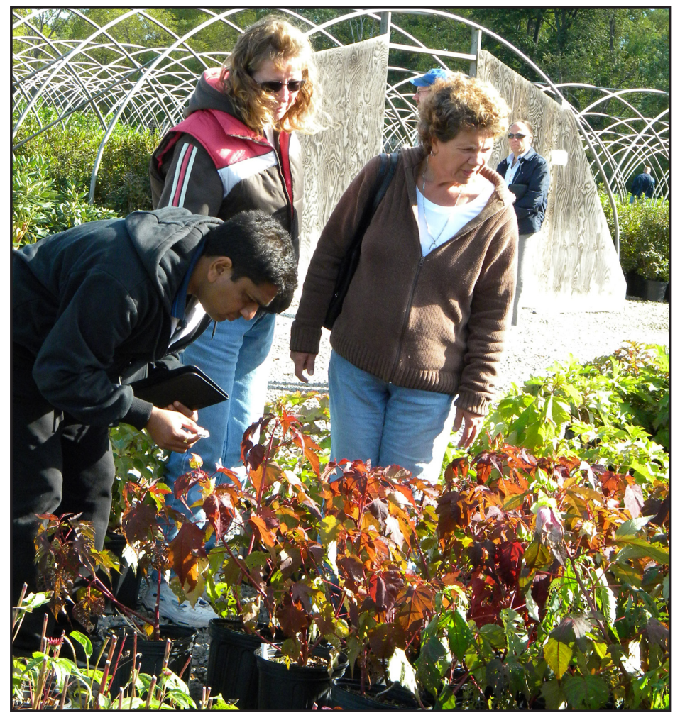
Growers' tour visits Niagara area.

sponsors and staff who work very hard to ensure that this industry continues to be a vibrant, successful and fun sector to work in!