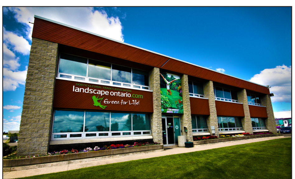
The new signage at LO home office.